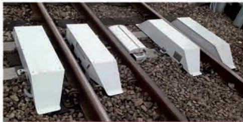
IWMS installation Outdoor system